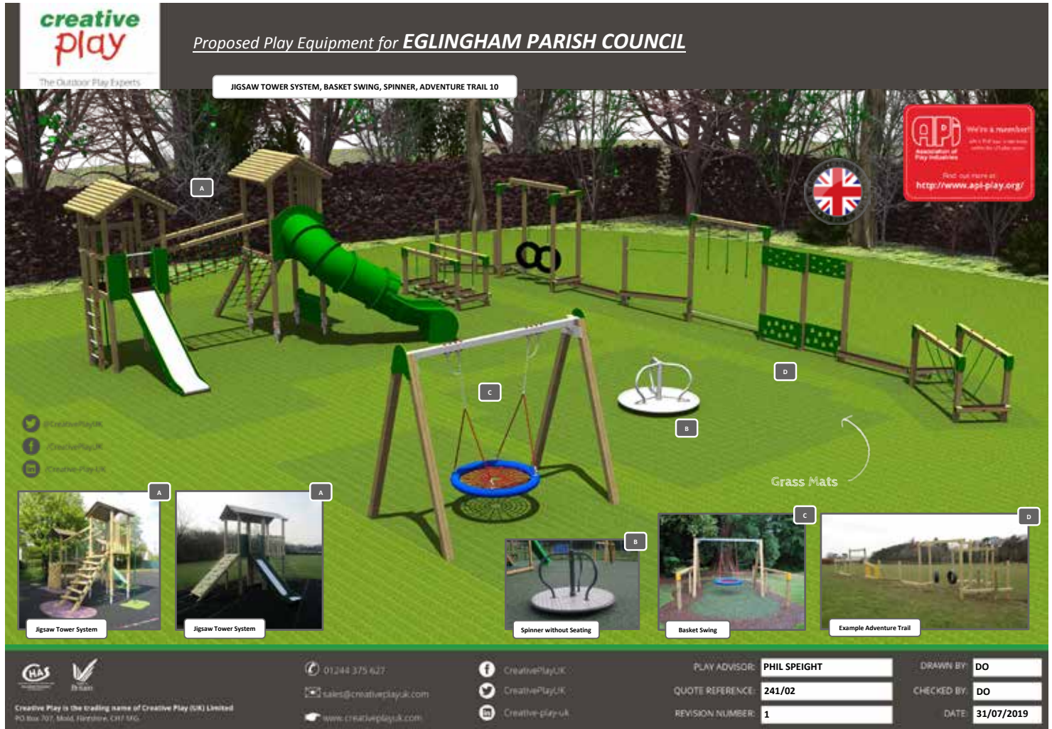
Image of the Tower System

This shows the proposed layout, including some example pictures of play equipment in situ.