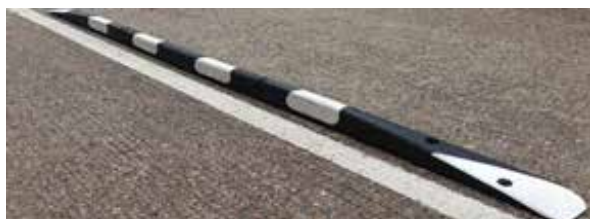
Kerb Orca Example

B6346 – Bridge - Currently there is no footway across the bridge and pedestrians are walking in the road. A build out is proposed on the West side of the bridge to force all traffic to use the southern area of the bridge in a priority working system. The remaining area of the bridge to the North is to be utilised for pedestrians. This area is to be segregated from the carriageway by the use of “kerb orca” rubber kerbs that are usually used to segregate cyclists from motorists where cycle lanes are present.