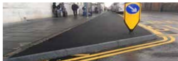
Surface Mounted Rubber Kerb Example

The introduction of the priority working system provide a traffic calming measure in the centre of the village, whilst the narrowing of the bridge also assists in slowing down traffic. NCC have funding available for the bridge works during 2019/20 and if there is support for this work to be done it could potentially be implemented during 2019/20.